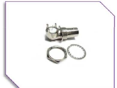
S2G BNC R/A Metal