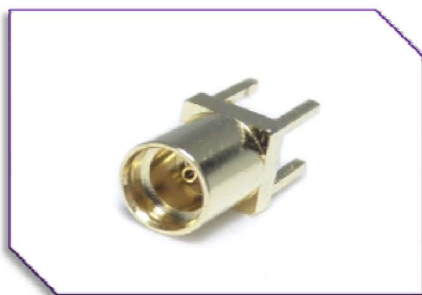
MMCX MMCX PCB Jack Type