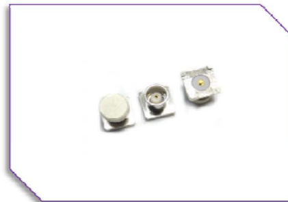
MCX-P MCX PCB Jack