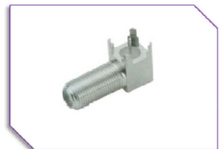
F F PCB DIP Type