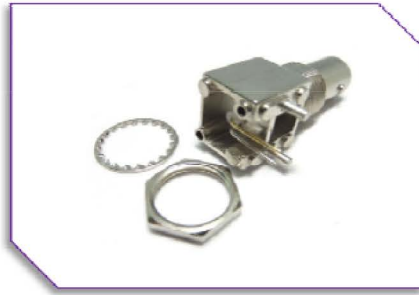
S2B BNC PCB R/A Metal Body