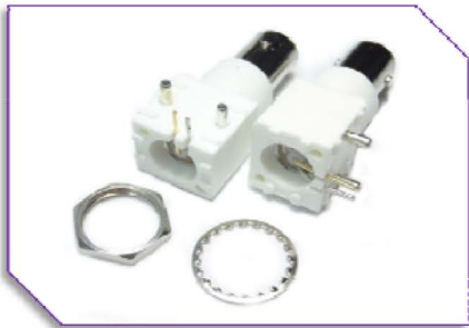
S24 BNC PCB Straight