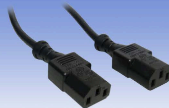
2x C13 Connectors