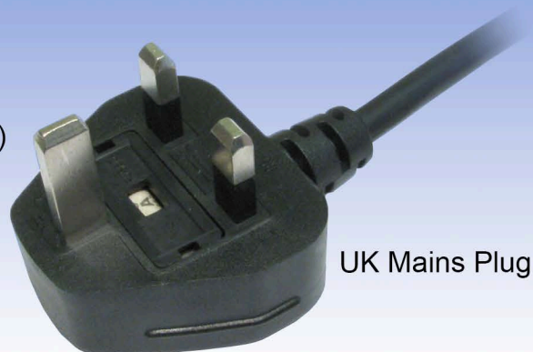
UK Mains Plug